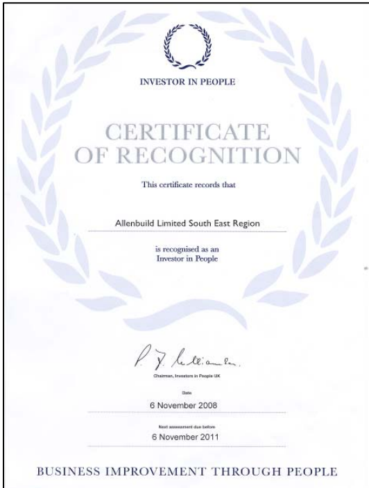
Investors in People